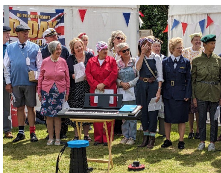
V E Celebration at Craigtoun