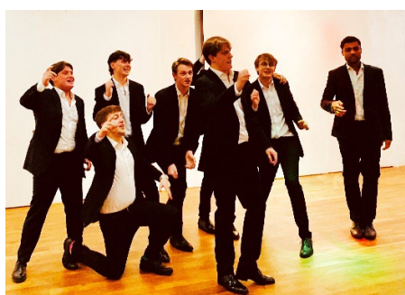
The Other Guys

2024 was a busy year for us and here are some of the highlights: