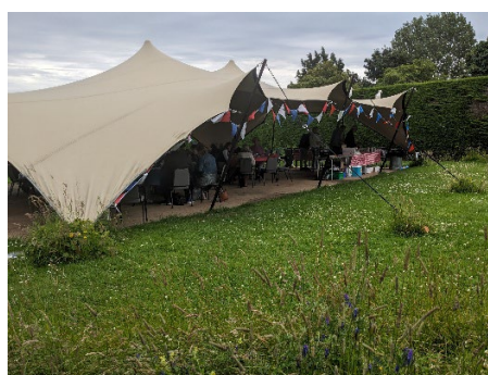
Lunch in the Botanics