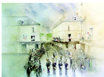
Loches en 1944 exhibition