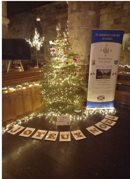
The Loches Alliance Tree in Holy Trinity