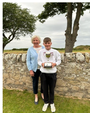
Loches Cup for Junior Golf