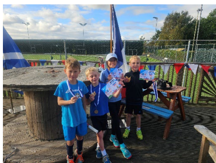
French Tennis Tournament – The Winners